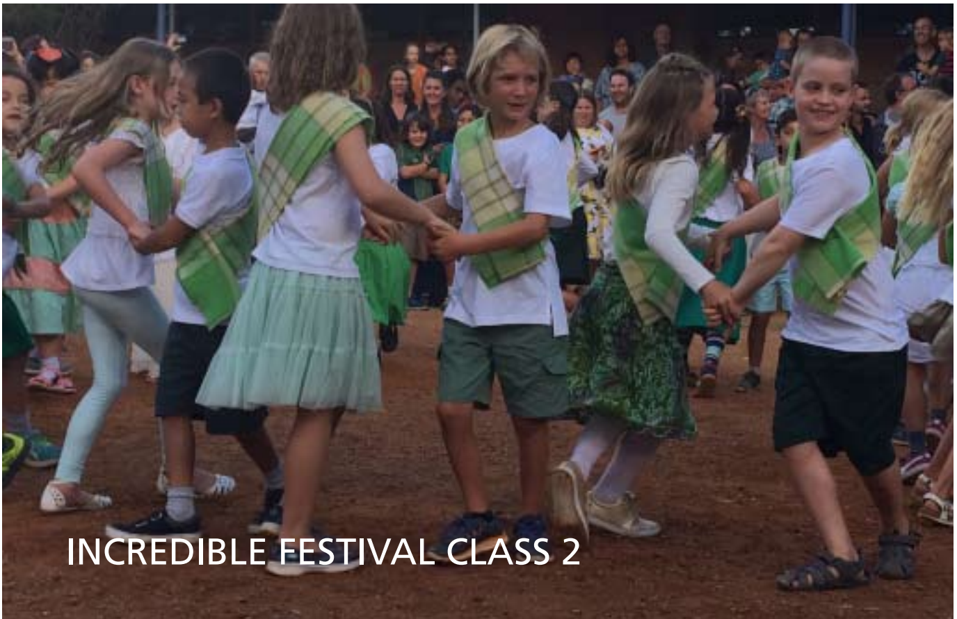
INCREDIBLE FESTIVAL CLASS 2